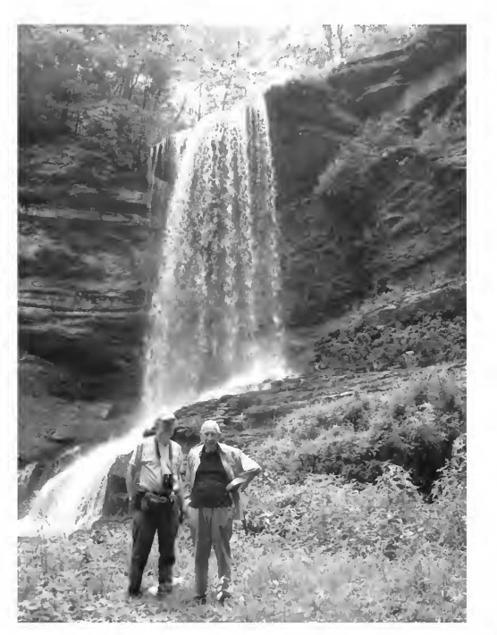
Authors at Abrams Falls, Washington Co., VA, 24 August 2011